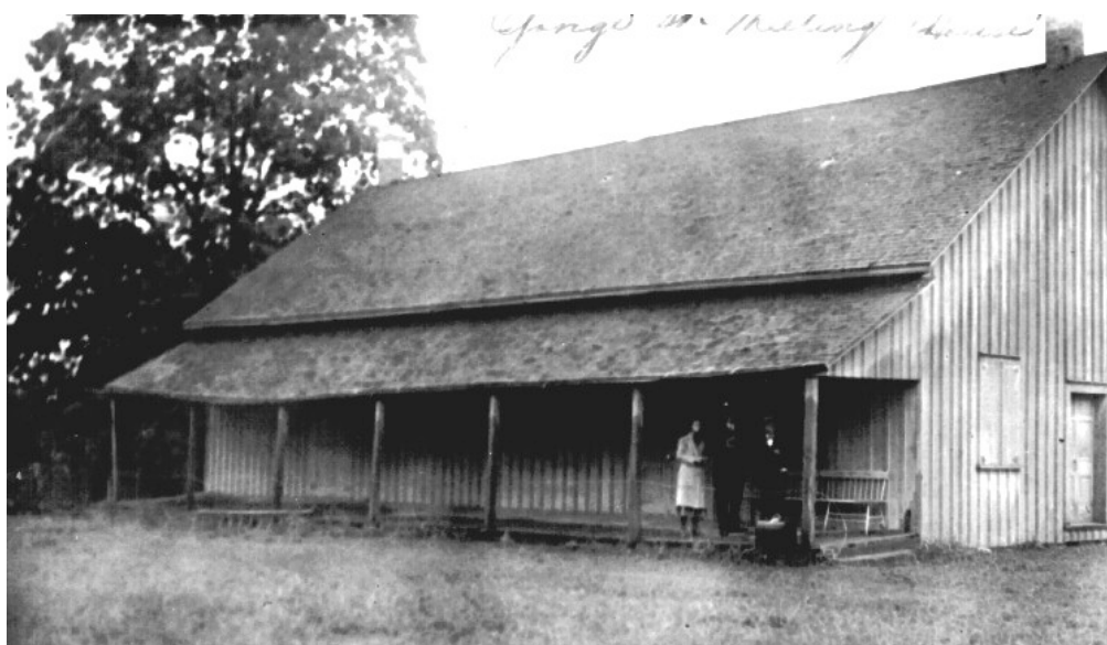
An early twentieth-century image of the meetinghouse from the south-east where the driveway approached the building. Two doors are found on the south facade, providing separate entrances for men (east end) and women (west end). The doors are double-leafed, with three panels to each leaf.

It was to these people who bravely faced the risks, and endured the hardships and privations of pioneer immigration and to this garden which they planted in this wild Canadian bushland, that our thoughts turned as we luxuriously rolled along old Yonge Street, to the Spring Meeting on the last Sabbath morning in May. Reverently we recalled the lines from Mrs. Hemans: