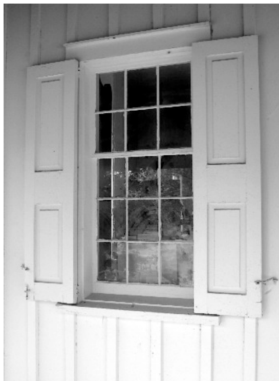
One of four windows along the south facade. The windows are glazed with 15 small panes, a significant number of which are original. Windows on the north and south of the meetinghouse are comprised of six over 9 panes, while the remaining windows are eight over twelve panes.

After all these years a cloud of picturesque romance crowns this transaction. It was on September 23, 1787, that three Indian chiefs met the government's representative, Sir John Johnson at the Carrying Place on the Bay of Quinte, and bargained for all this land. Eighteen years later, in August, 1805 the government representatives again met with the Indians on the bank of the River Credit. This time there were eight Indian chiefs,