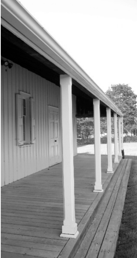
The meetinghouse porch looking east towards the men's half. Unlike the women, whose conveniences were accessible from within the meetinghouse, men's conveniences were, up until the renovations in 1975, a separate back house structure at the north-east corner of the meeting house.