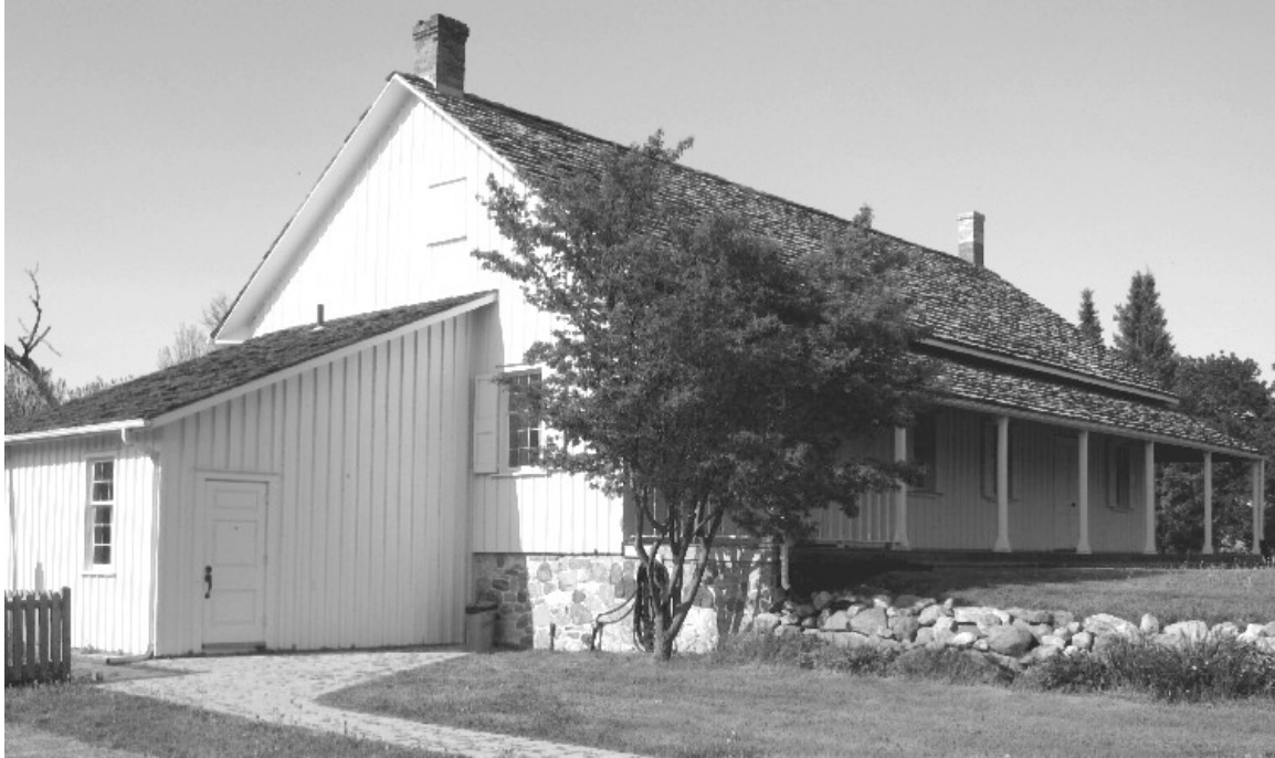
Yonge Street Meetinghouse, built between 1810-1812, from the south-west. The entrance, added in 1975 when the meetinghouse was raised and a basement added, replacing the women's conveniences built in 1822.