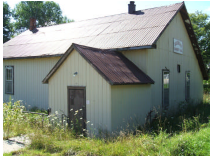
Collingwood Meeting House – Heathcote, Ontario

There are many gaps in the story of the Meetings of Friends in Grey County , but hopefully enough has emerged to ensure that their contribution to the religious life of the county will not be forgotten.