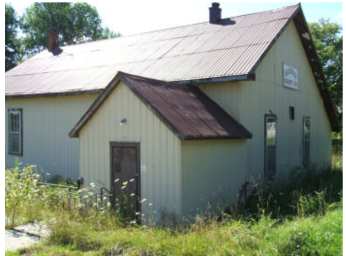
Collingwood Meeting House – Heathcote, Ontario

There are many gaps in the story of the Meetings of Friends in Grey County , but hopefully enough has emerged to ensure that their contribution to the religious life of the county will not be forgotten.